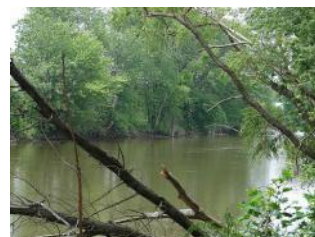
The Mahoning River at the Mill Creek confluence