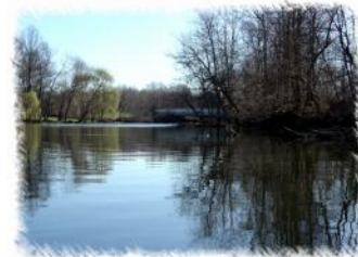
The confluence of Eagle Creek (right) and the Mahoning River near Canoe MetroPark in Warren Township